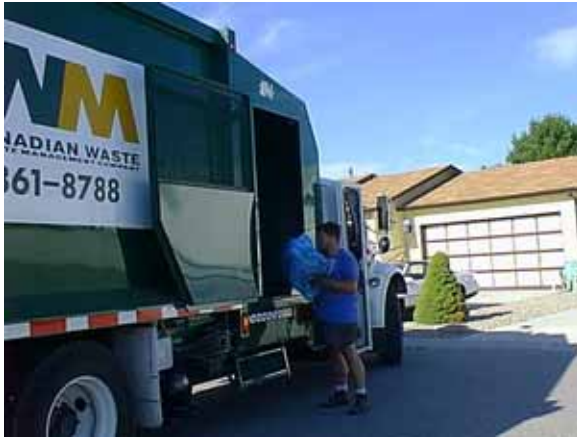
Curbside 'Blue-bag' Pickup

Removing materials from the waste stream that can be recycled and composted can significantly reduce waste. In Kelowna, tin, aluminium, glass, newsprint, cardboard, writing paper, magazines, some plastics, and phone books can all be recycled. These items can be placed in the curbside pick-up program or can be taken to any of the recycling depots. In 2007, the curbside recycling program is expanding to include all household rigid plastic containers and plastic film like grocery bags and shrink wrap. Glass, however, will only be accepted at the recycling or bottle depots. Other materials such as batteries, metals, propane tanks, yard and garden waste and wood chips can all be processed for reuse through proper segregation at the Glenmore Landfill or other commercial venues.