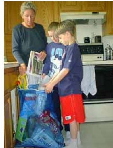
Blue Bag Recycling Program

Additionally, the Regional Waste Reduction Office coordinates a variety of programs aimed at reducing garbage going to the landfill, including the Blue Bag Curbside Recycling Program, the annual Household Hazardous Waste and E-Waste Roundups, and social marketing education programs like Go Natural Garden Parties, the Community Litter Clean-up, WasteWise @Work, and various other public relations and education campaigns.