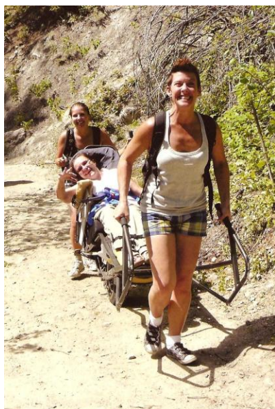
Adaptive hiking with a TrailRider at Mission Creek Regional Park

Any person who has a disability that impedes their ability to get outside and enjoy outdoor activities like hiking, cycling, and paddling is invited to join CRIS Adaptive Adventures. Any person with any physical, mental, or social limitation (or any combination of these) is encouraged to contact CRIS to see what is available to them. People with disabilities seek outdoor adventures for the same reasons people without disabilities do: to get outside, connect with nature, socialize, increase abilities, learn new things, reduce stress, and increase overall quality of life!