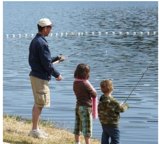
Learning to fish at Shannon Lake Regional Park

This program is for children 16 and under, with a one fish per day limit. No fishing license is required. This is a free drop-in program weekends in May, no registration required.