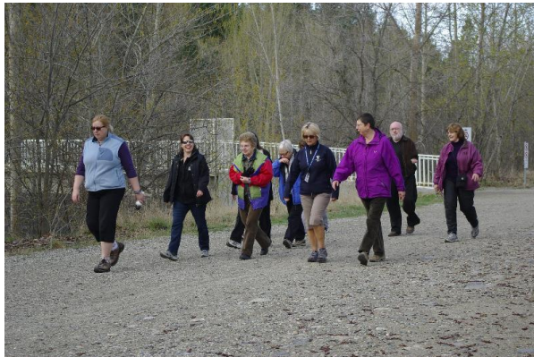
Tracks Walking Club