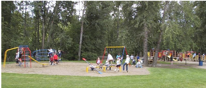
The current playground at Mission Creek Regional Park

Upgrades are required to meet growing usage and to ensure that the playground meets safety requirements and can be efficiently maintained. Upgrades will include a new play area for children aged 2-12, a multisensory play area, and upgraded safety surfacing. The redesign focuses on inclusive play for children of all abilities, both active and passive play opportunities, and using natural play elements appropriate to Mission Creek Regional Park.