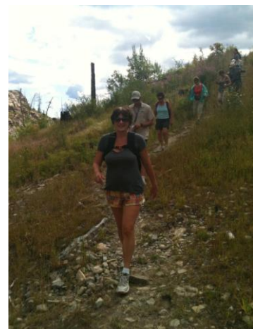
Enjoying a guided hike with the Take off on a Hike program

Hike along phase 2 of Mission Creek Greenway for a closer look at the geology and history of the creek.