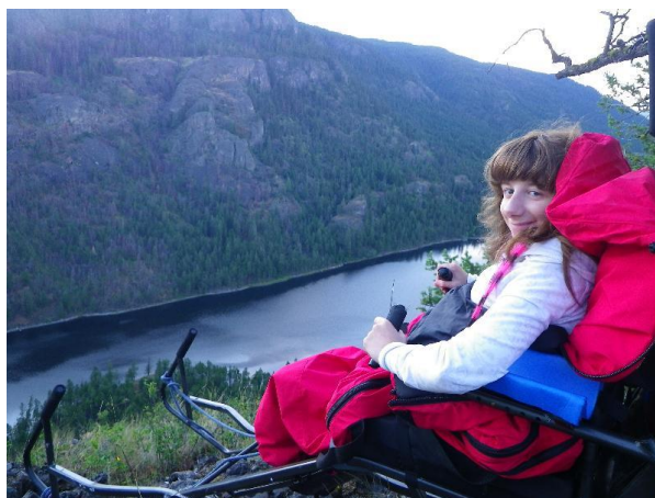
Enjoying the view at Rose Valley Regional Park

The Community Recreational Initiatives Society's (CRIS) Adaptive Adventures is a Kelowna based non-profit charitable society established in 2001. CRIS is a unique and powerful program that uses adaptive equipment in nature settings to unite volunteers and people with disabilities to experience nature. Adaptive Adventures is dedicated to not only assisting people with disabilities to get out of their homes to participate in and enjoy firsthand the natural healing properties of nature but also to guide and support them toward improved quality of life and increased abilities. CRIS personnel assist people with disabilities, and their families, to experience nature and explore places they would not otherwise be able to access on their own through the use of human powered adaptive equipment and team work.