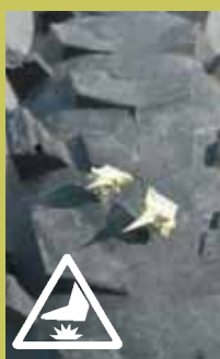
PUNCTURE VINE IN A BIKE TIRE