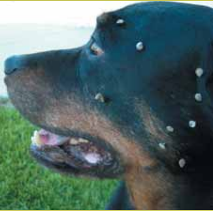
HOUNDS TONGUE SEEDS CATCH A RIDE ON OUR PETS