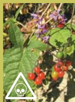
BITTERSWEET NIGHT SHADE

Weeds choke out good plants so cows and wild animals have nothing to eat. Some weeds are poisonous and will make you sick if you eat them. Some weeds give you an itchy rash if you touch them. Puncturevine can pop your bike tires with their burrs which also hurt when you or your pets step on them. Some bad insects like to hide in weeds - it's their home. Some weeds carry diseases that can hurt good plants.